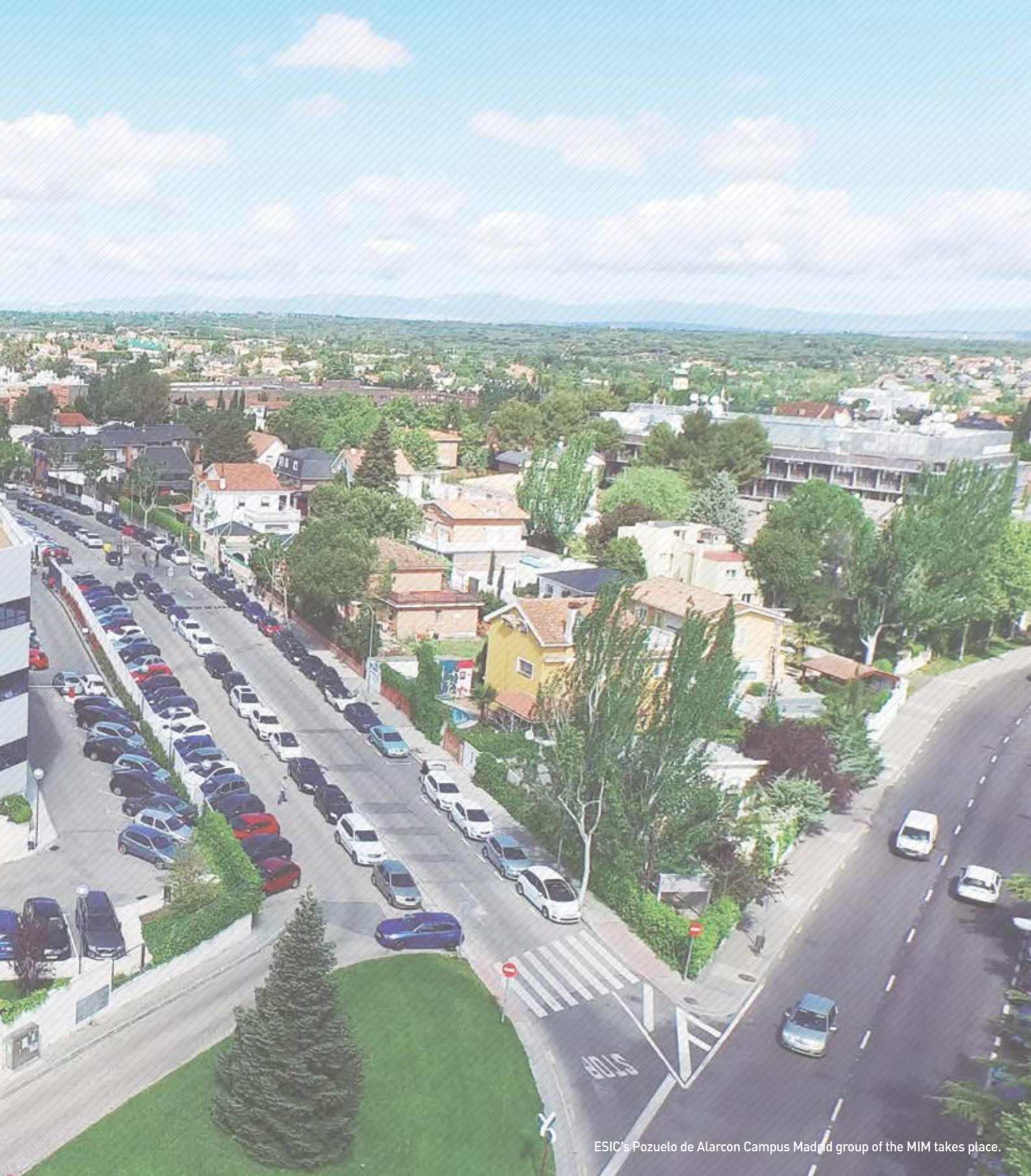
ESIC's Pozuelo de Alarcón Campus Madrid group of the MIM takes place.